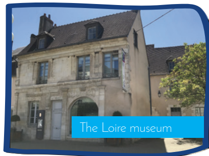
The Loire museum

The congregation of the reformed Augustinians settled here in 1616. The building, hosting the museum today, is constructed with various elements and reused stones; which also explains some rather surprising details of its architecture and some irregularities.