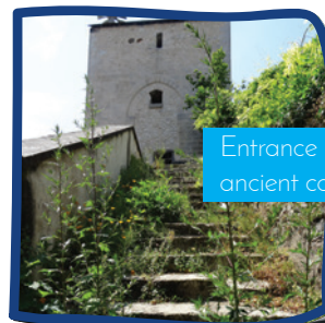
Entrance of the ancient castle