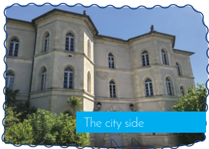
The city side

In the 1850s the surrounding wall was partially demolished to allow the construction of the new prison . On the side of the city, there is a facade with two towers which evokes the architecture of a castle while in front of you appears a long nave ending in an apse (on each side of which the cells were distributed). Please know that this plan, inspired by the religious architecture, was designed to contribute, symbolically, to the redemption of prisoners.